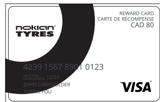
Illustration of the prepaid card as an example only. The received card can be different from that represented here.